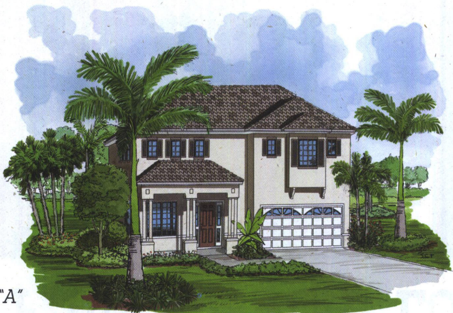
The Willow "A"